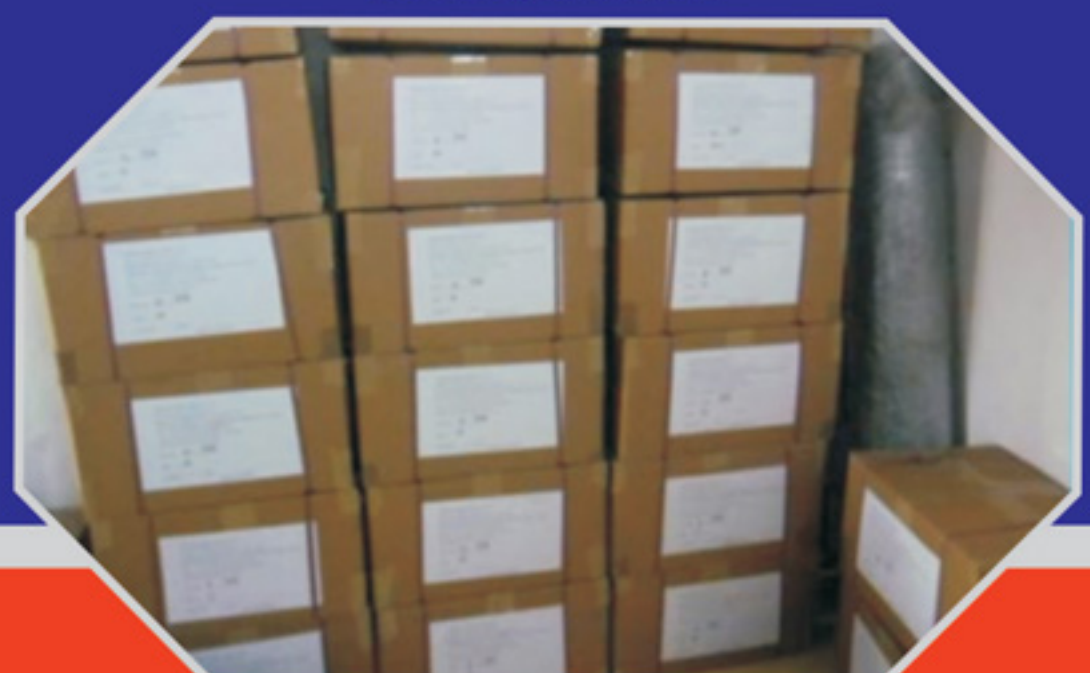
Final Packing Department

State of the art technology and quality test observed