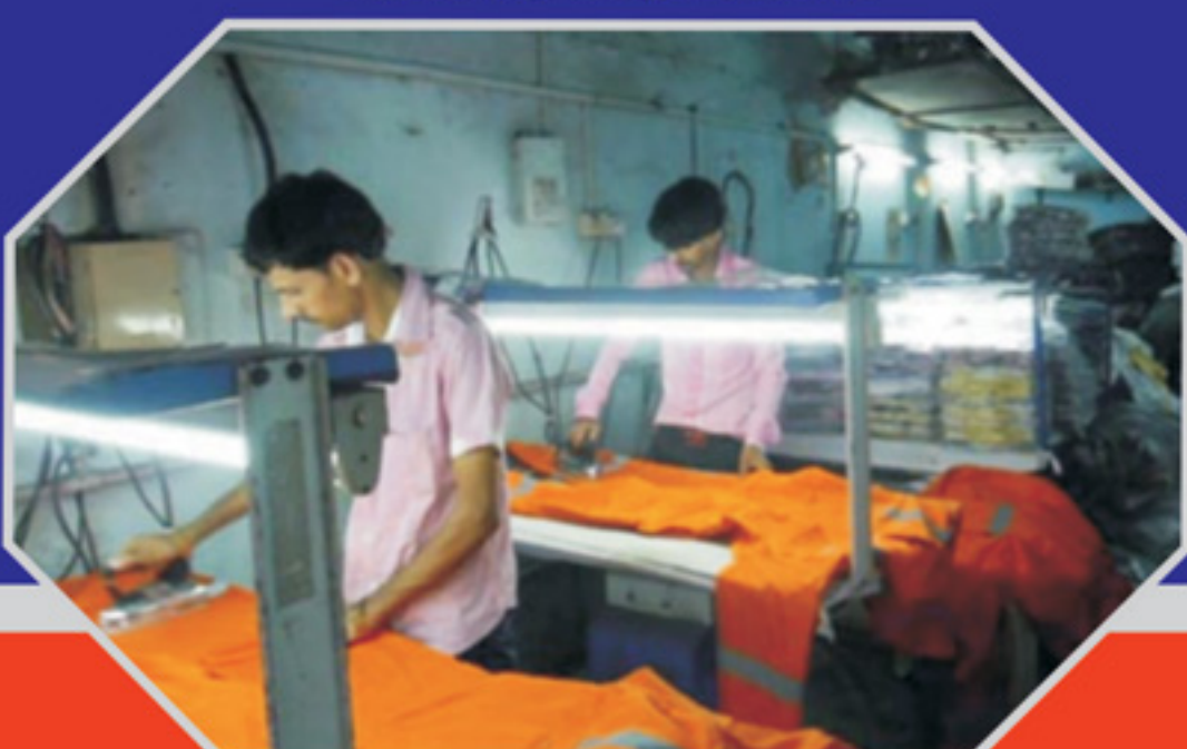
Ironing & Finishing Department